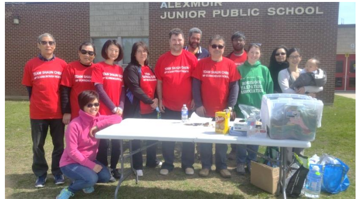
Awesome volunteers from MP Shaun Chen's Office, Cavalry Logos Baptist Church, and RTA executive team for our annual spring clean-up!