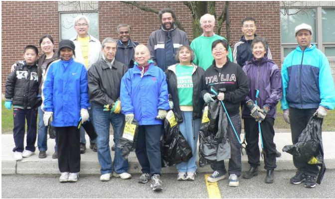
A section of the community that came out to participate in the annual community clean-up 2012.

This year's community clean-up is scheduled for Saturday, April 19, 9:45 a.m. - 11:45 a.m. Meet in the parking lot of Alexmuir Jr Public School.