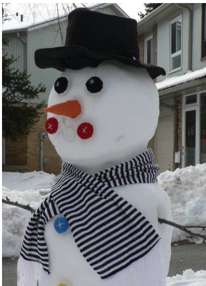
Rosewood's newest resident is rumoured to have moved shortly after things warmed up. However, if you see him please make him aware of the general meeting on Thursday, April 17 at 7:00 p.m. at Alexmuir Jr Public School

This year's community clean-up is scheduled for Saturday, April 19, 9:45 a.m. - 11:45 a.m. Meet in the parking lot of Alexmuir Jr Public School.